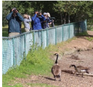
Canada Geese — who's watching whom?

We then drove to a pullout at the top of the reservoir, hoping for a warbler. We were pleased to hear Orange-crowned Warblers calling the moment we got out of our cars. Only a couple of the team were able to see the bird, which mostly hid behind the leaves. On we went to the next stop, which was a picnic area halfway along the reservoir. There we were pleased to see three Common Mergansers swimming in the quieter corner of the lake — it being Saturday there were people fishing along the shoreline and a boat out on the water, and mergansers tend to be shy. Canada Geese along the shore were less shy as they casually watched us watching them.