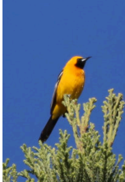
Hooded Oriole at McClellan Ranch

We started a timer at 8am and began by birding the feeders, treeline, field and skies of McClellan Ranch Park. We quickly picked off the expected feeder-loving birds: Lesser Goldfinch, Dark-eyed Junco, House Finch and others, and we got spectacular looks at a shining yellow-and-black Hooded Oriole in the top of an evergreen.