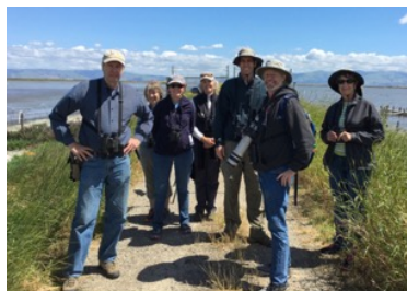
The Wandering Kestrels (Bino is behind the lens)

Shoreline Lake had no new birds to offer. The timer was running out so we hurried back to the mud flats to scan with our scopes and see if we could pick up any more species for the day. We checked every Godwit for a hidden Whimbrel or Curlew, every Western Sandpiper to see if one was a Least Sandpiper or maybe a Dunlin. But no new birds appeared. The timer ended and we all thanked each other for a good time. We ended the day in high spirits and I was happy with 68 species of birds...after all, 17 birds/hour is a pretty decent pace.