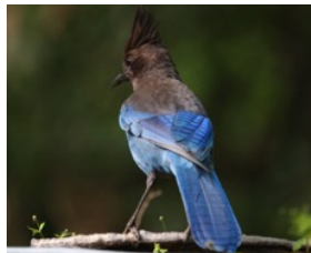
Steller's Jay along Stevens Creek