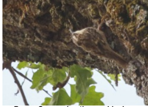
Brown Creeper hunting upside-down

We then drove to a pullout at the top of the reservoir, hoping for a warbler. We were pleased to hear Orange-crowned Warblers calling the moment we got out of our cars. Only a couple of the team were able to see the bird, which mostly hid behind the leaves. On we went to the next stop, which was a picnic area halfway along the reservoir. There we were pleased to see three Common Mergansers swimming in the quieter corner of the lake — it being Saturday there were people fishing along the shoreline and a boat out on the water, and mergansers tend to be shy. Canada Geese along the shore were less shy as they casually watched us watching them.